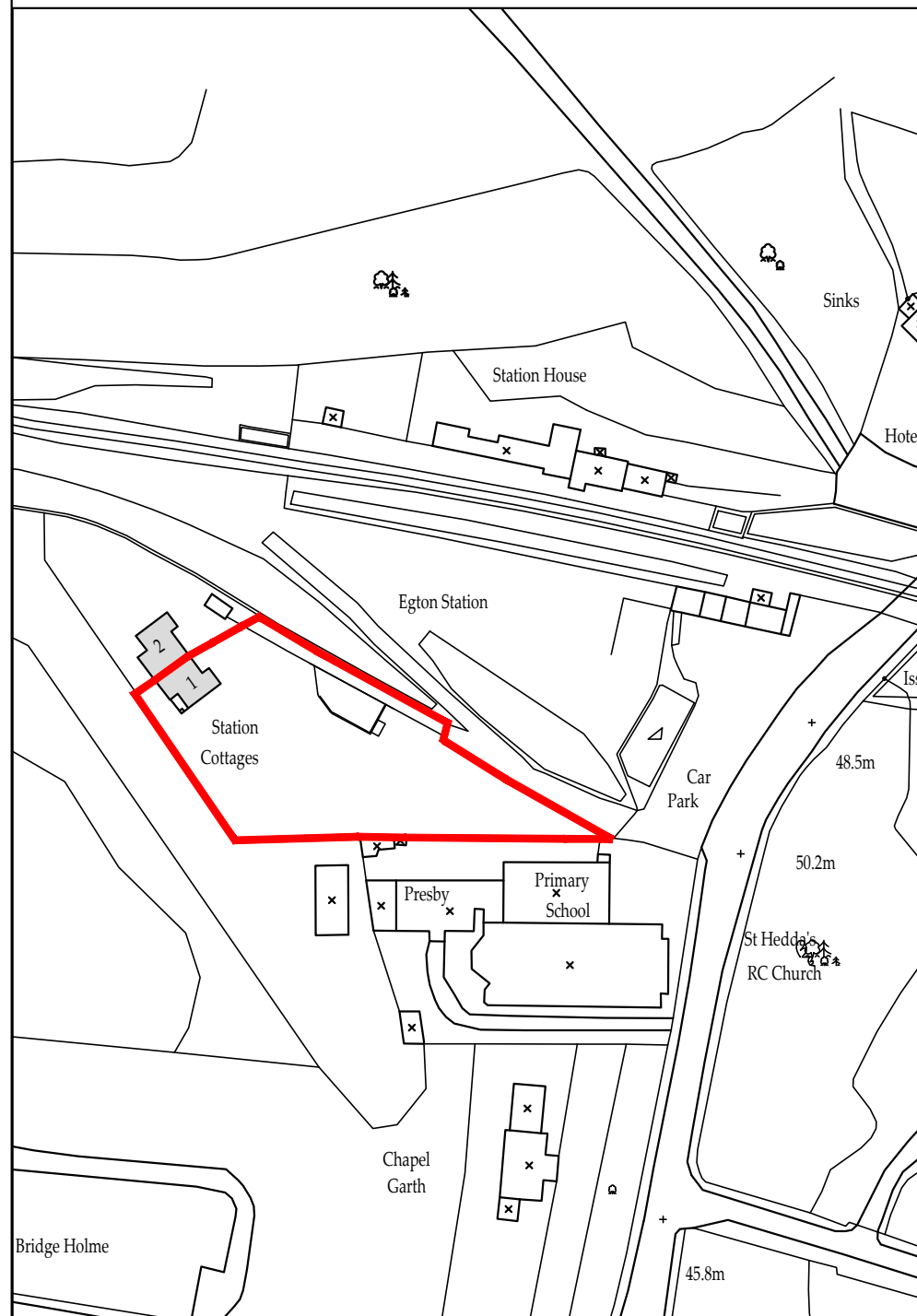
○ Location Plan Scale 1:1250