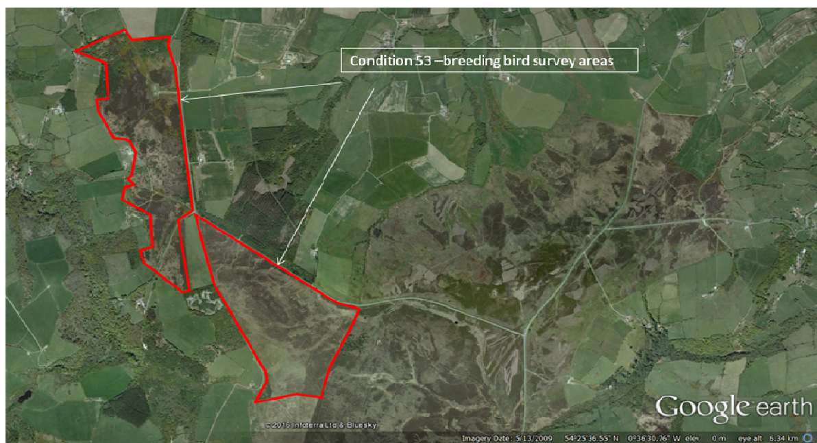
Figure 1. Survey areas Site description